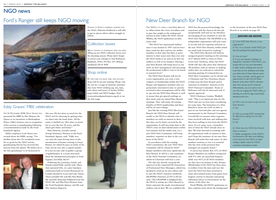
Above: Example spreads from Keeping The Balance magazine.